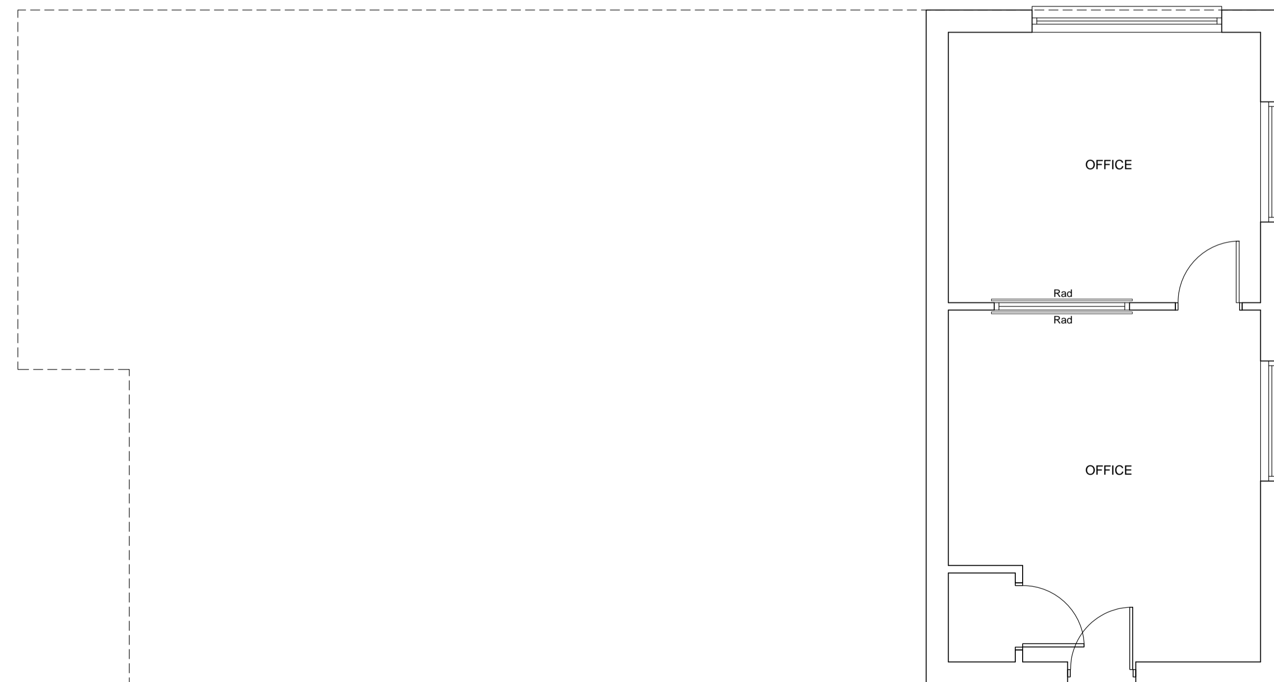
Basement Floor Plan

Ground Floor / Basement GA Plans scale 1:50 @ A1