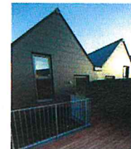
3 Aluminium framed windows