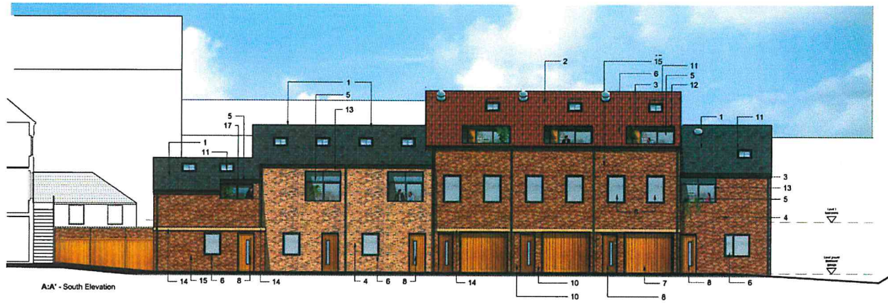
A:A' - South Elevation