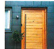
8. Timber doorset