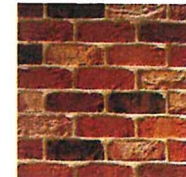
2. Brick work - To match existing (Eg. Olds Watermill blend)