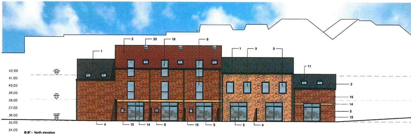
B:B' - North elevation