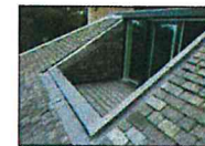
12. Inverted dormer