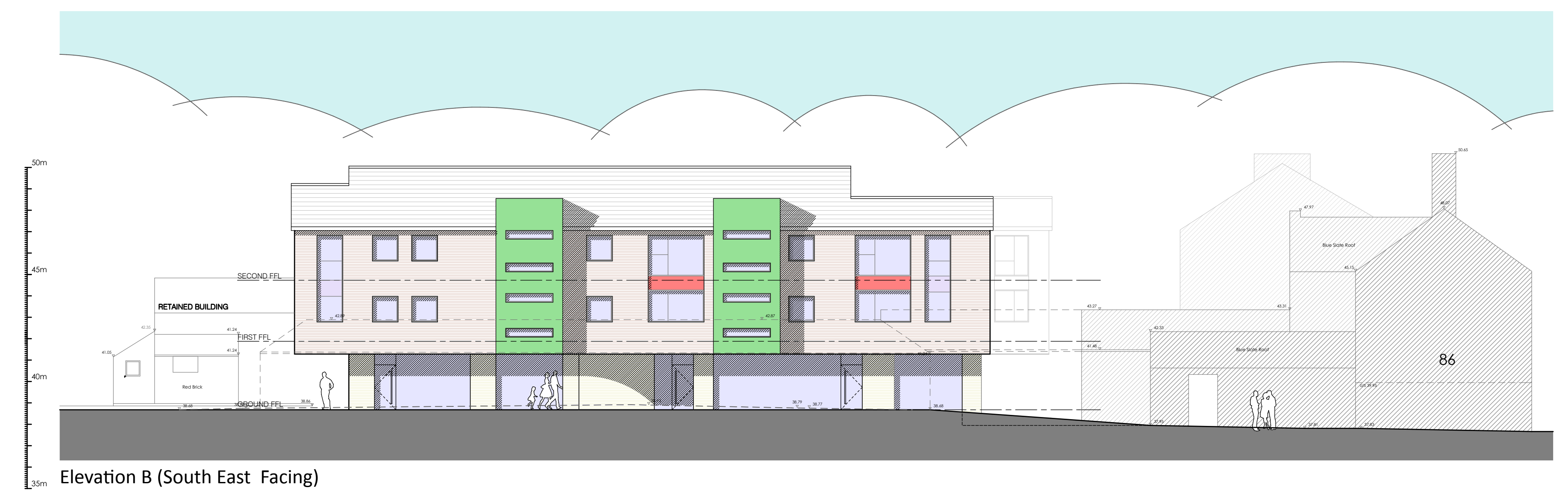
Elevation B (South East Facing)