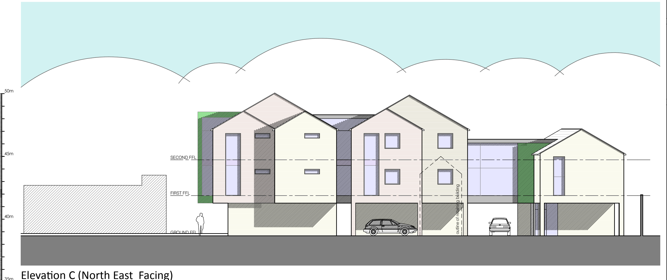
Elevation C (North East Facing)