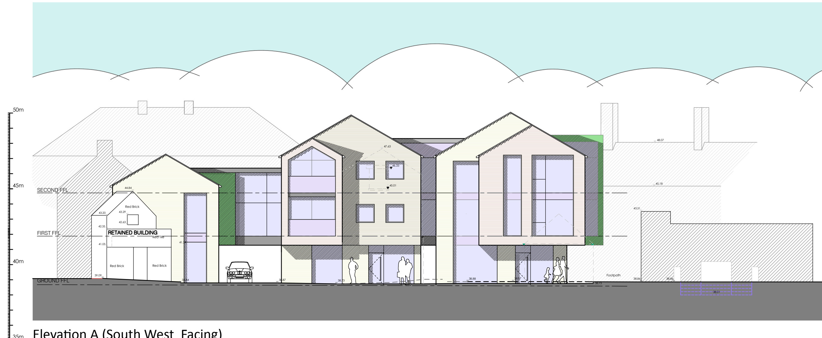
Elevation A (South West Facing)

ADDITIONAL NOTES ALL WORK TO BE CARRIED OUT IN ACCORDANCE WITH THE BUILDING REGULATIONS AND THE REQUIREMENTS OF THE LOCAL AUTHORITY